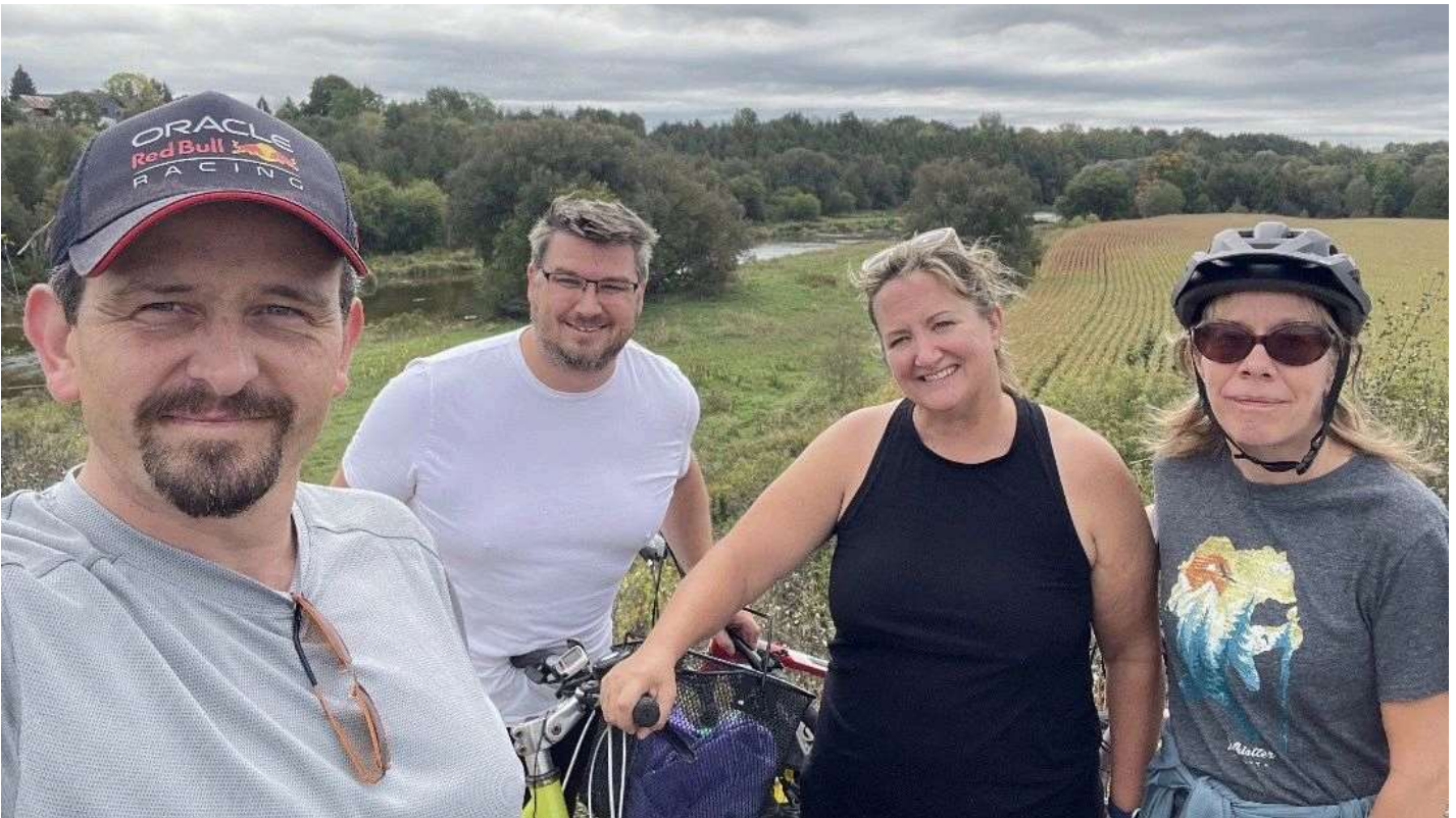
Goderich to Guelph Trail Ride