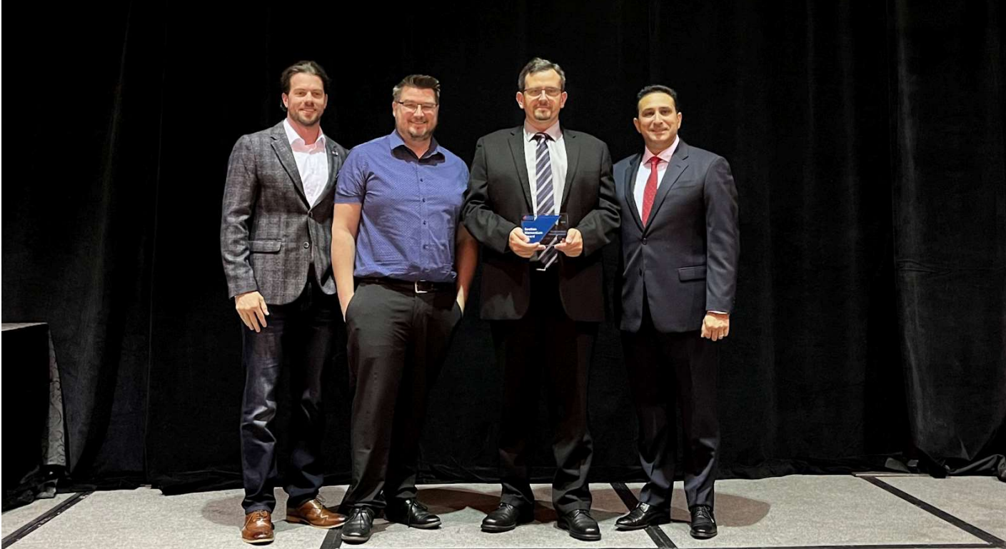
Section Momentum Award at 2024 Annual Conference in Hamilton