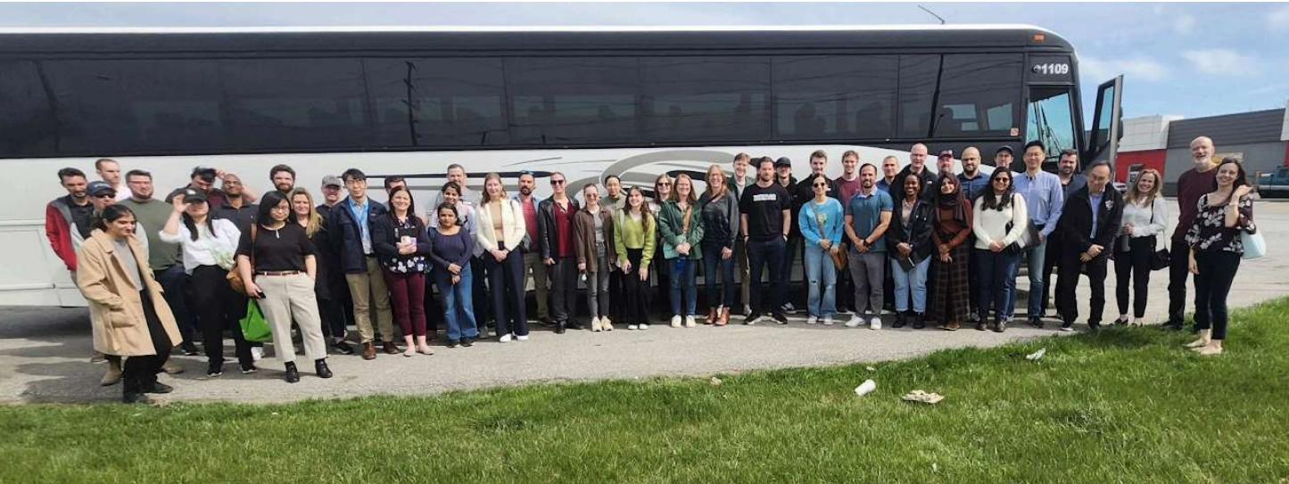
Gordie Howe Bridge Tour Attendees