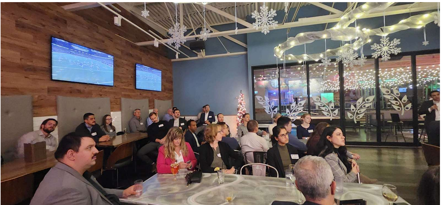
2024 AGM Attendees