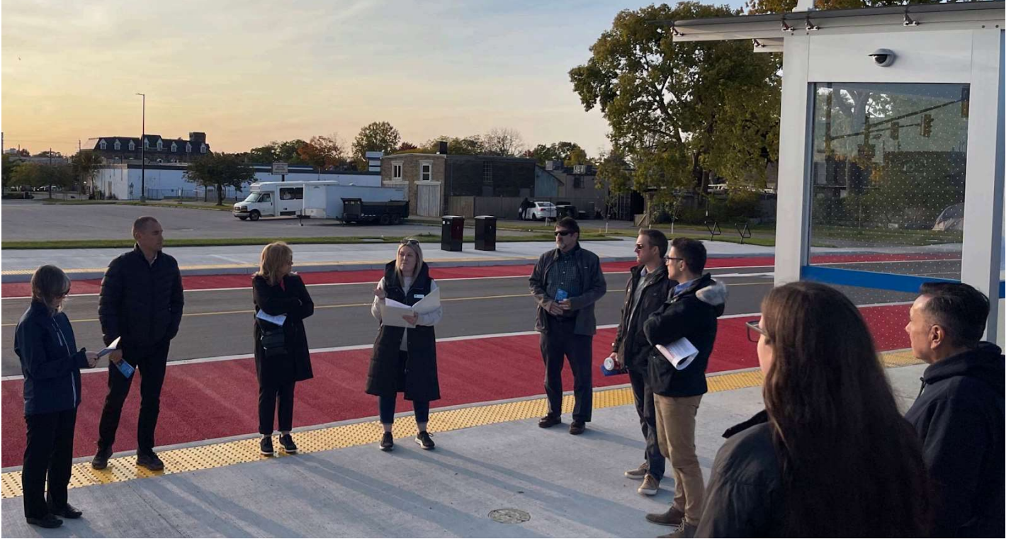
BRT Platform Tour in London, Ontario